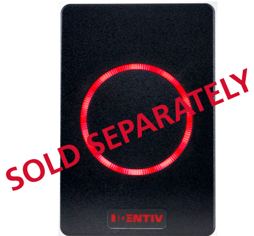
Figure 2: uTrust TS Reader sold separately.

Identiv, Inc. (NASDAQ: INVE) is the leading global player in physical security and secure identification. Identiv's products, software, systems, and services address the markets for physical and logical access control and a wide range of RFID-enabled applications. Customers in the government, enterprise, consumer, education, healthcare, and transportation sectors rely on Identiv's access and identification solutions. Identiv's mission is to secure the connected physical world: from perimeter to desktop access, and from the world of physical things to the Internet of Everything.