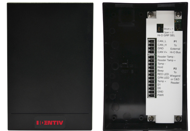
Figure 2: Exit Reader Module for EM-100 (front and back view)

Identiv (NASDQ: INVE) is a global security technology company that establishes trust in the connected world, including premises, information, and everyday items. CIOs, CSOs and product departments rely upon Identiv's trust solutions to reduce risk, achieve compliance, and protect brand identity. Identiv's trust solutions are implemented using standards-driven products and technology, such as digital certificates, strong authentication, mobility, and cloud services.