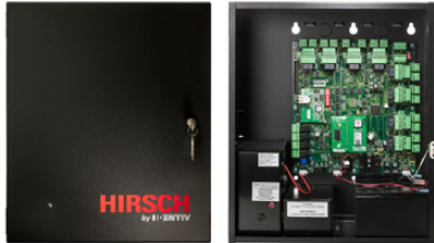
CPNI RATED IDENTIV MX CONTROLLER SECURE NETWORK INTERFACE BOARD 3 (SNIB3) PSU 24HOURS STAND-BY BATTERIES

Approved for UK Government use, for details contact CPNI