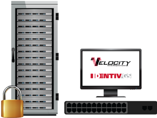
CPNI RATED SECURE SERVER