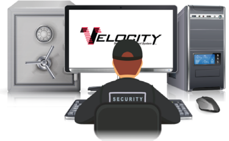
CPNI RATED SECURE WORKSTATION